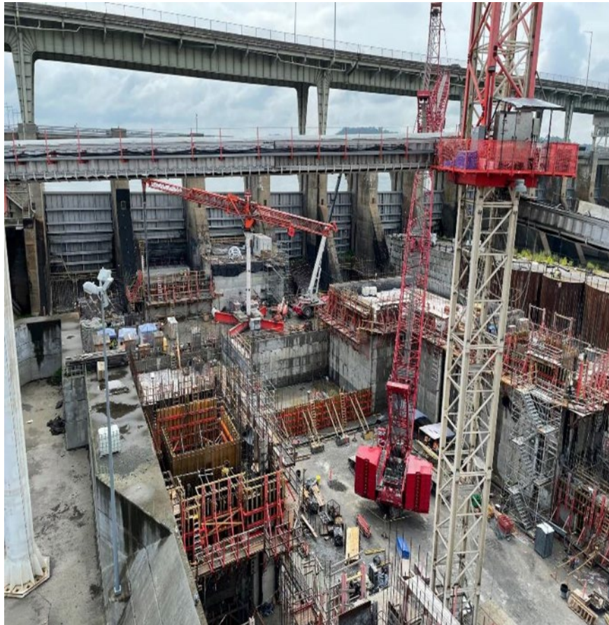
June 2022 – Looking Upstream