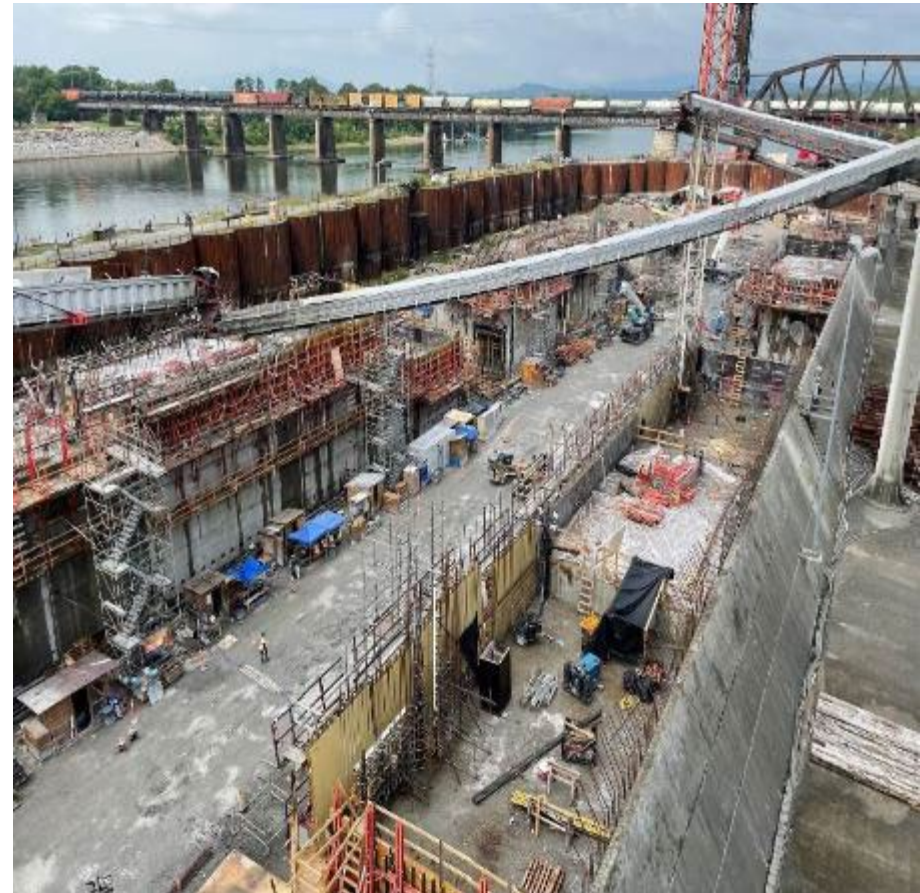
June 2022 – Looking Downstream